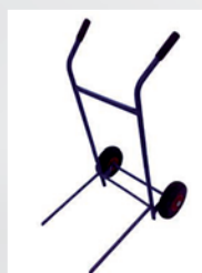
Shipping cart for manipulation with packet for bale press EKOPACK 50.2

Is hydraulic bale press with pressing power 5 ton , used in supermarkets, junk centre, stocks, factories, and so on. It is suitable for small, middle and also for big companies. The Press has got a strong and stable construction in the pressing chamber on which lays a sliding pressing head. High pressure is regulated by a hydraulic cylinder with the possibility of regulating the pressing power which guarantees long-term reliability. The front doors opening system enables easy removal of the pressed package with the shipping cart.